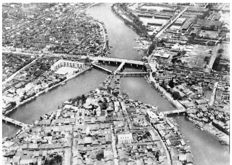
Hiroshima Before Bombing

The port city of Hiroshima, in the south-western Honshu, Japan and headquarters to Imperial Second General Army, was calmly absorbed in its manufacturing and logistic duty.