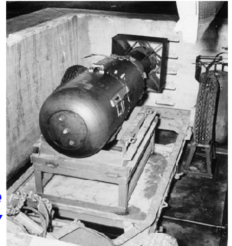
Little Boy Unit On Trailer Cradle In Pit, Before Being Loaded Into Enola Gay's Bomb Bay

The much-awaited order arrived. Tibbets choose the aircraft for his mission on 5th August and christened her Enola Gay after his mother. The cylindrical "Little Boy" with 64 kg of uranium 235 was loaded, and the aircraft flew off from North Tinian Field at 2.45 AM on 6th August 1945 on a special mission . . .