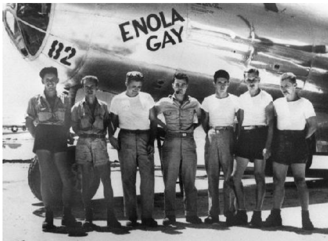
Enola Gay team - Col. Tibbets In Centre